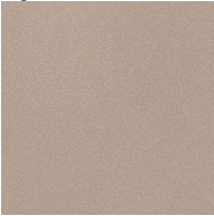
Lagoon - 06