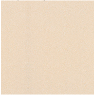
Hampton Bay - 05