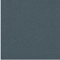
Twilight - 14