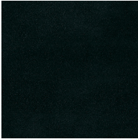
Black Velvet - 02