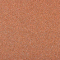
Copper Mine - 27