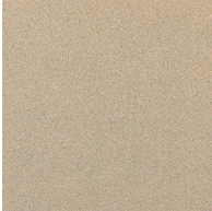
Champagne Cream - 26