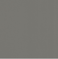
Lost Dream - 15