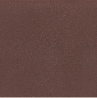
Rusty Angel - 09