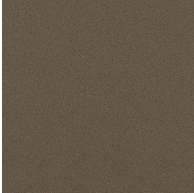
Ancient Bronze - 28