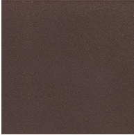
Milk and Chocolate - 11