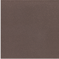
Rusty Rush - 10