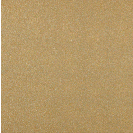
Jazz Gold - 29